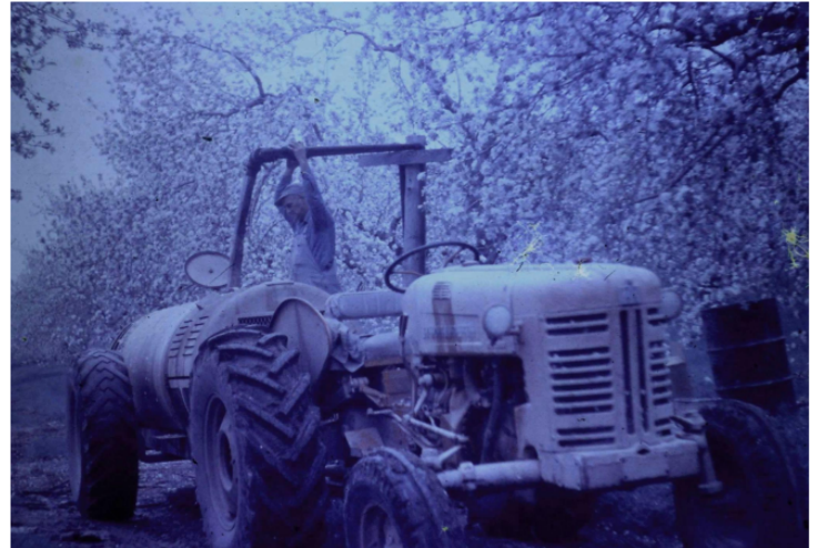
IMAGE: PHOTOGRAPH FROM THE AUTHOR'S FAMILY FARM, TAKEN DURING THE SPRING APPLE BLOSSOM, CIRCA 1954

Walk into a grocery store and you'll likely see a wide variety of apples. But did you know that many of today's most popular varieties have been developed in recent years and didn't exist in the 1940s, when this story took place? For example, the popular HoneyCrisp variety was introduced into the market in the 1990s, while Pink Lady was first cultivated in Australia in 1973. All apple varieties mentioned in Enemies in the Orchard —McIntosh, Jonathans, Empires—have been double- and triple-checked to be varieties that would have been farmed in Michigan in 1944.