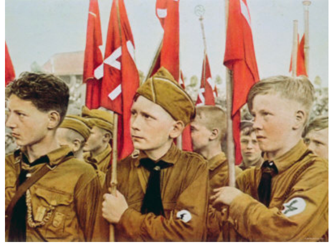
PHOTO: HITLER YOUTH, GERMANY, ILLUSTRATION, CIRCA 1933. PUBLIC DOMAIN.

In Adolf Hitler's Letters and Notes , a book that contains his personal correspondence, Hitler writes, "I begin with the young. We older ones are used up.[...] But my magnificent youngsters! Are there any finer ones anywhere in the world? Look at all these men and boys! What material! With them I can make a new world."