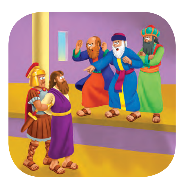
Jesus, help me trust you like you trust your Father.

The soldiers took Jesus to the leaders. The leaders were looking for something to use against Jesus. So they made up false charges against him. Jesus could have defended himself. But he didn't He trusted God.