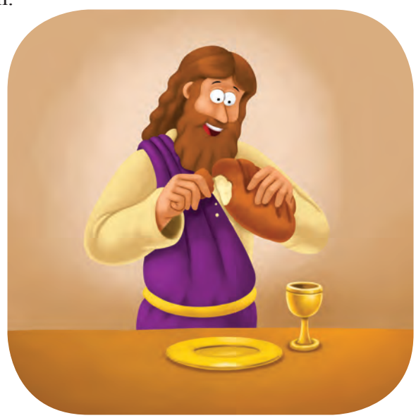
Jesus, help me remember that you are the Bread of Life! _{ m 325}

We need bread to live. Jesus is the Bread of Life!