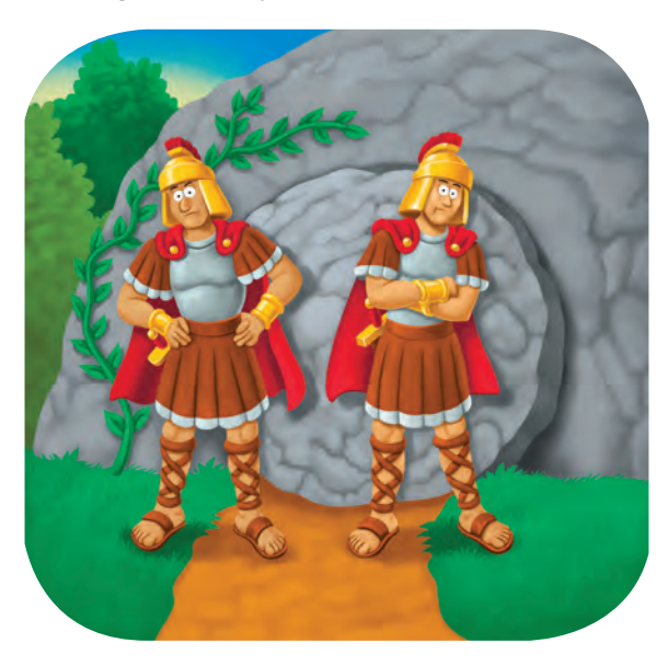
I am glad you are in charge of everything, God.

No matter how hard people try, they cannot stop God's plans.