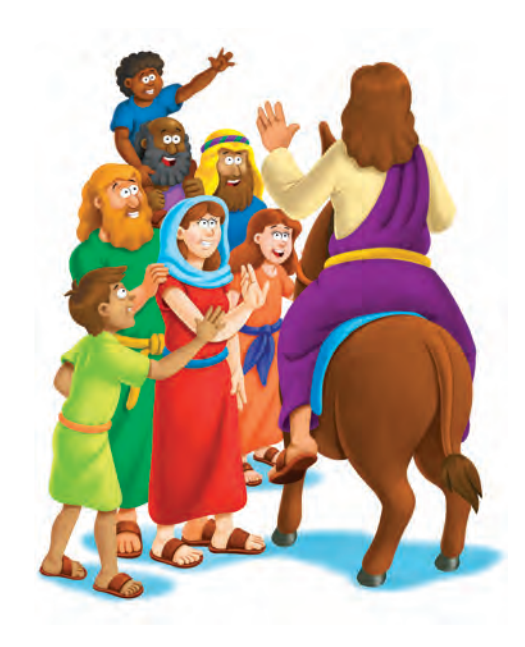
You are the one true King!

Jesus deserves to be treated like a king.