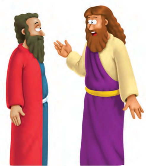
Help me give you honor every chance I get, Lord.

I want to show others how much I love God. Help me teach others about you.