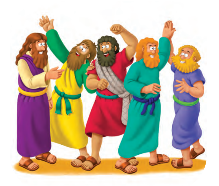
Jesus, I am ready to do my part.