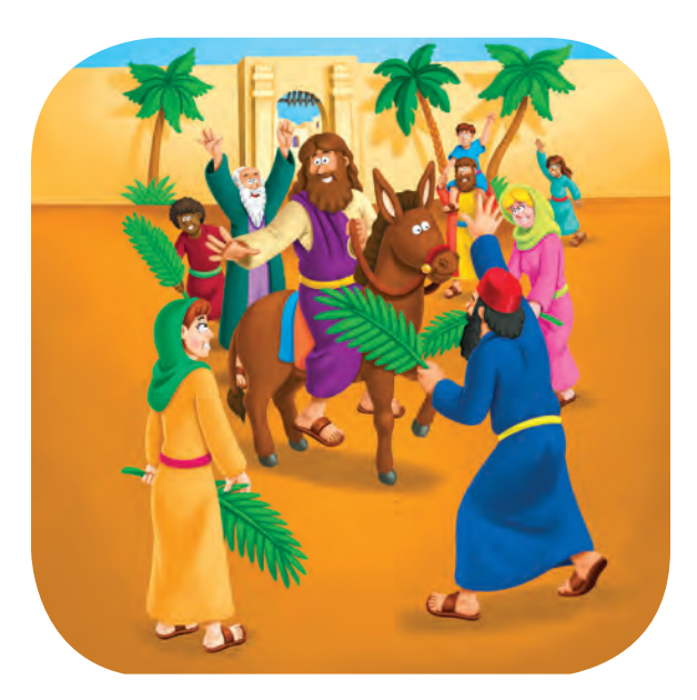
Jesus, you are the King of Glory!

Jesus rode into the city. The people cheered. They cried out in praise to God. They shouted, "Hosanna!" Palm branches were waved in the air. People put branches and cloaks on the ground in front of Jesus and the donkey.