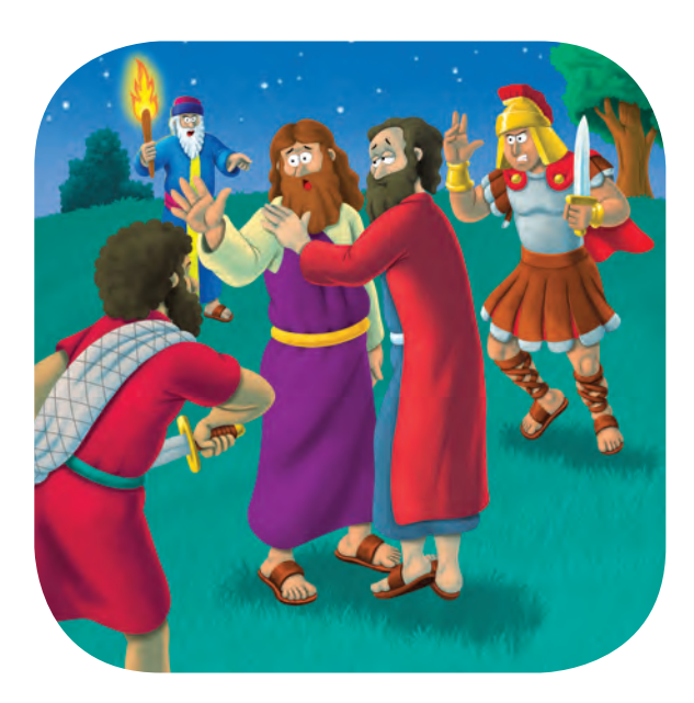
Help me follow your plans, God.

Jesus followed his heavenly Father's plans even though he could have stopped them.