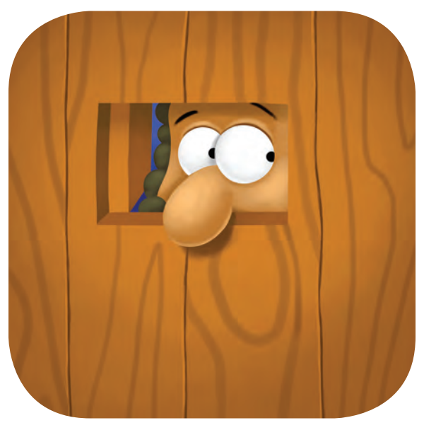
Thank you for friends that believe in you, God.