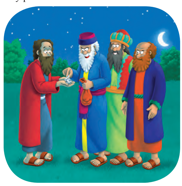
Help me to not be greedy, God!

God knows there are evil people in the world.