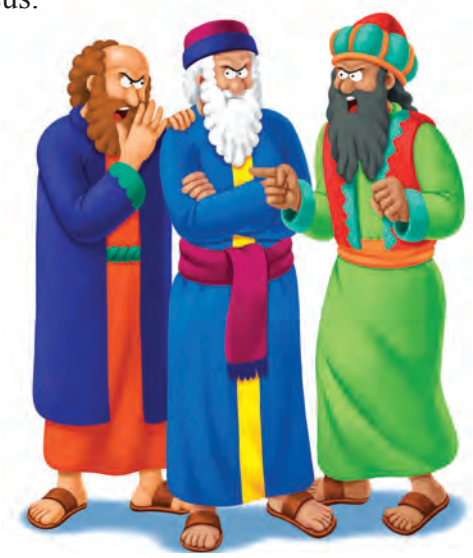
Jesus, I know that you are the King!

Some people do not like the idea of Jesus being the one true king.