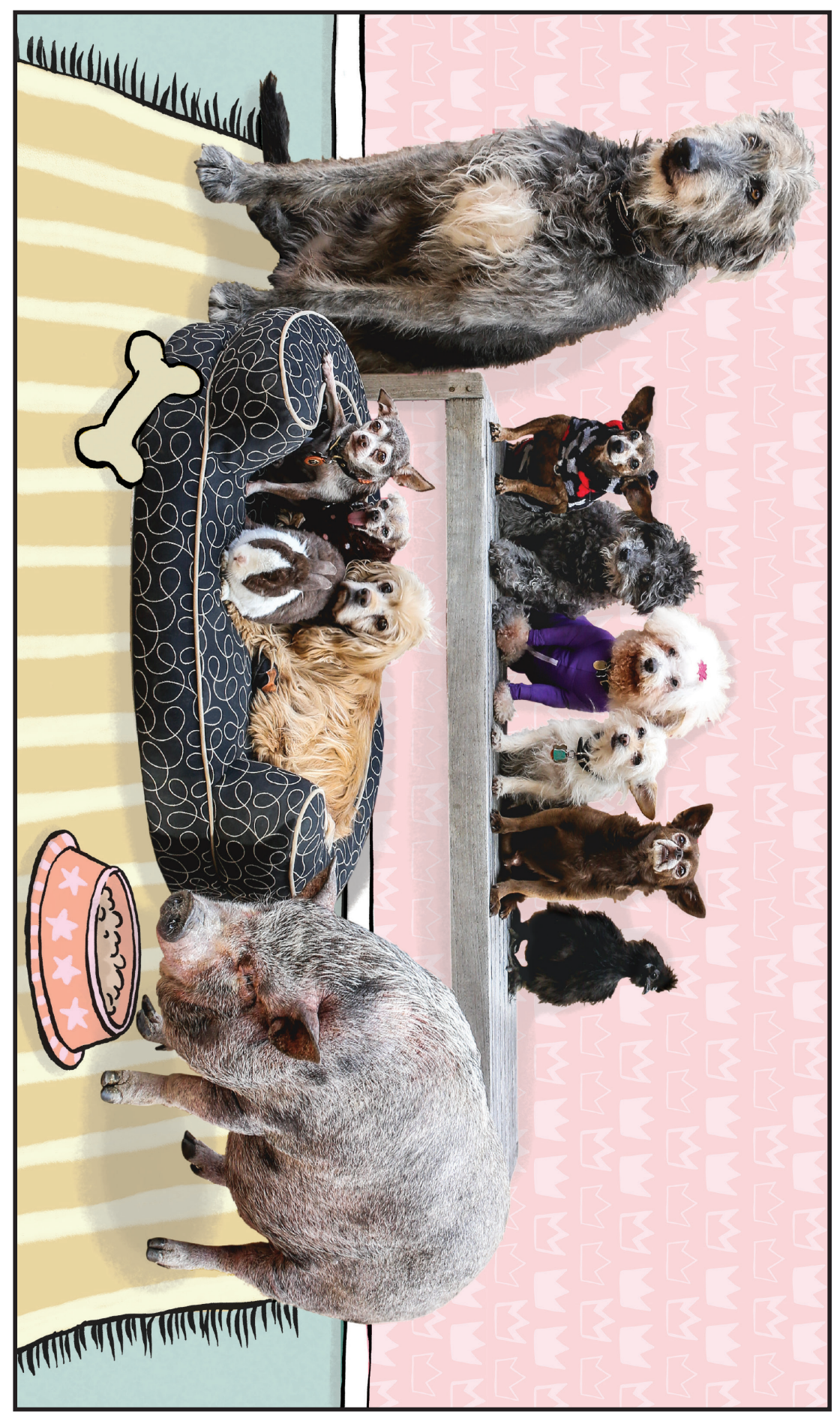
THE ONE AND ONLY WOLFGANG CURRICULUM GUIDE

alities of each character from reading the story, add speech bubbles for each animal in the portrait showing their situations. The Wolfgang is sitting for a family portrait in the image below. Using what you know about the person-In The One and Only Wolfgang, the author includes words showing what the animals are saying in different POINT OT VIEW IN THIS SITUATION. CCSS.ELA-LITERACY.RL.K.6; CCSS.ELA-LITERACY.RL.1.6; CCSS.ELA-LITERACY.RL.2.6; CCSS.ELA-LITERACY.RL.3.6